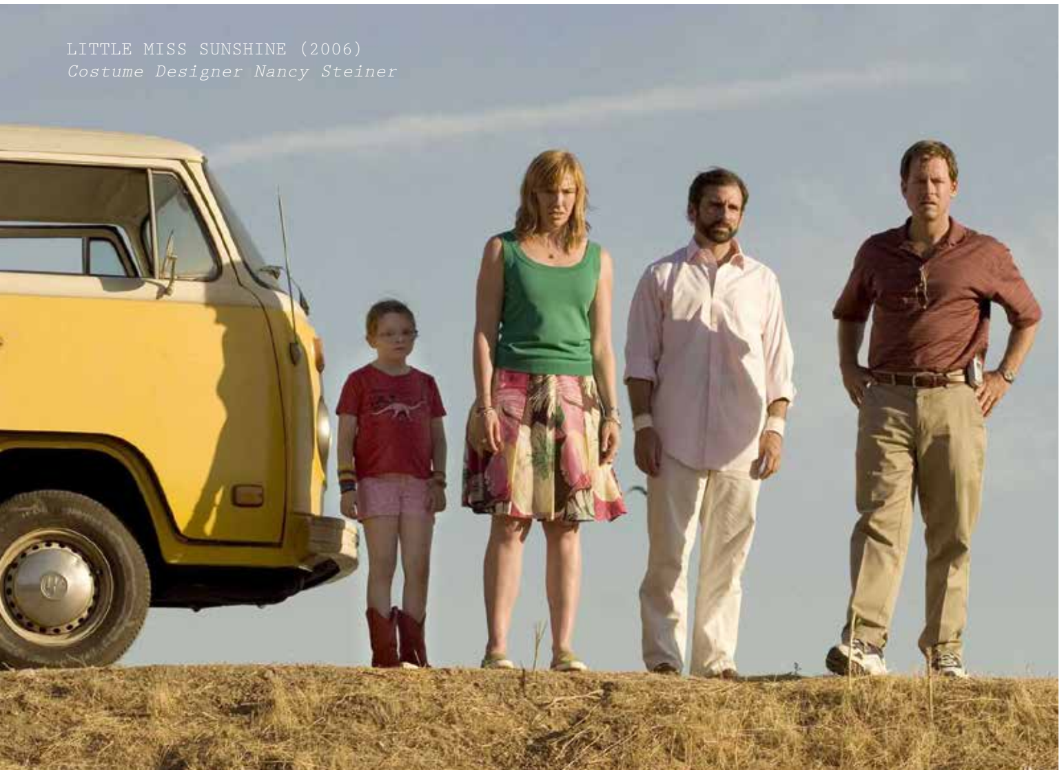
LITTLE MISS SUNSHINE (2006) Costume Designer Nancy Steiner

Padding may supply a slim actress with a more rounded shape or a pregnancy, and give a muscular actor the appearance of narrow, stooped shoulders or a big belly depending on the characters they are playing. Corsets, girdles and a variety