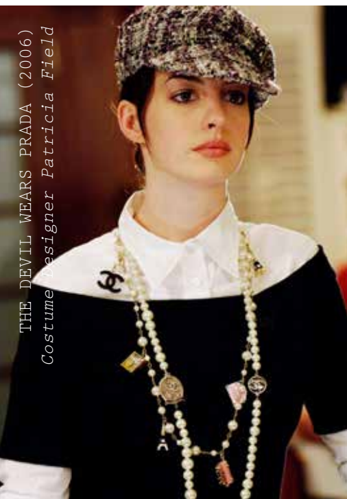
THE DEVIL WEARS PRADA (2006) Costume Designer Patricia Field