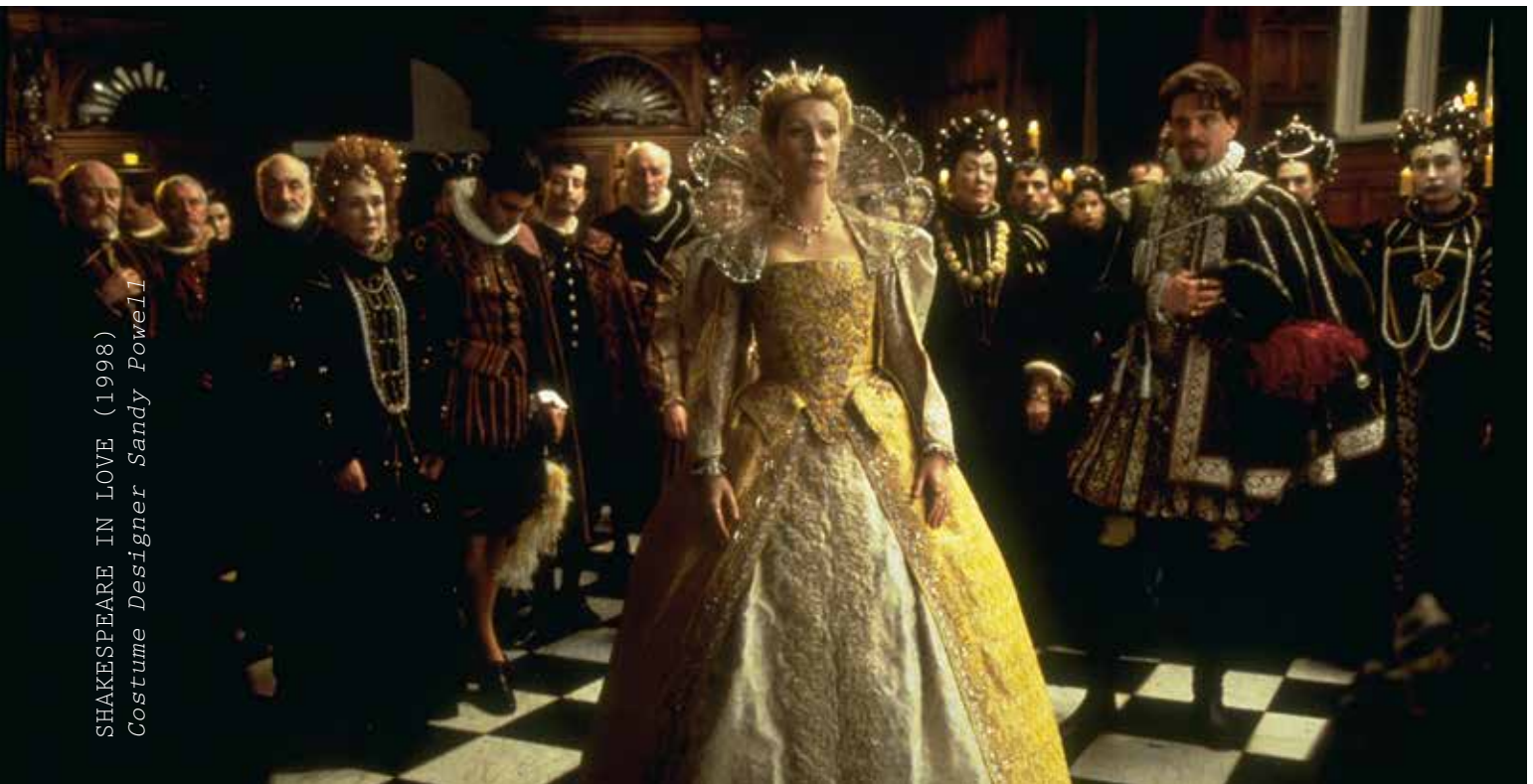
SHAKESPEARE IN LOVE (1998) Costume Designer Sandy Powell

Show your students a scene from a film. Ask them to describe each of the main characters in the scene. What happened in the scene? Ask students to analyze the color palette of