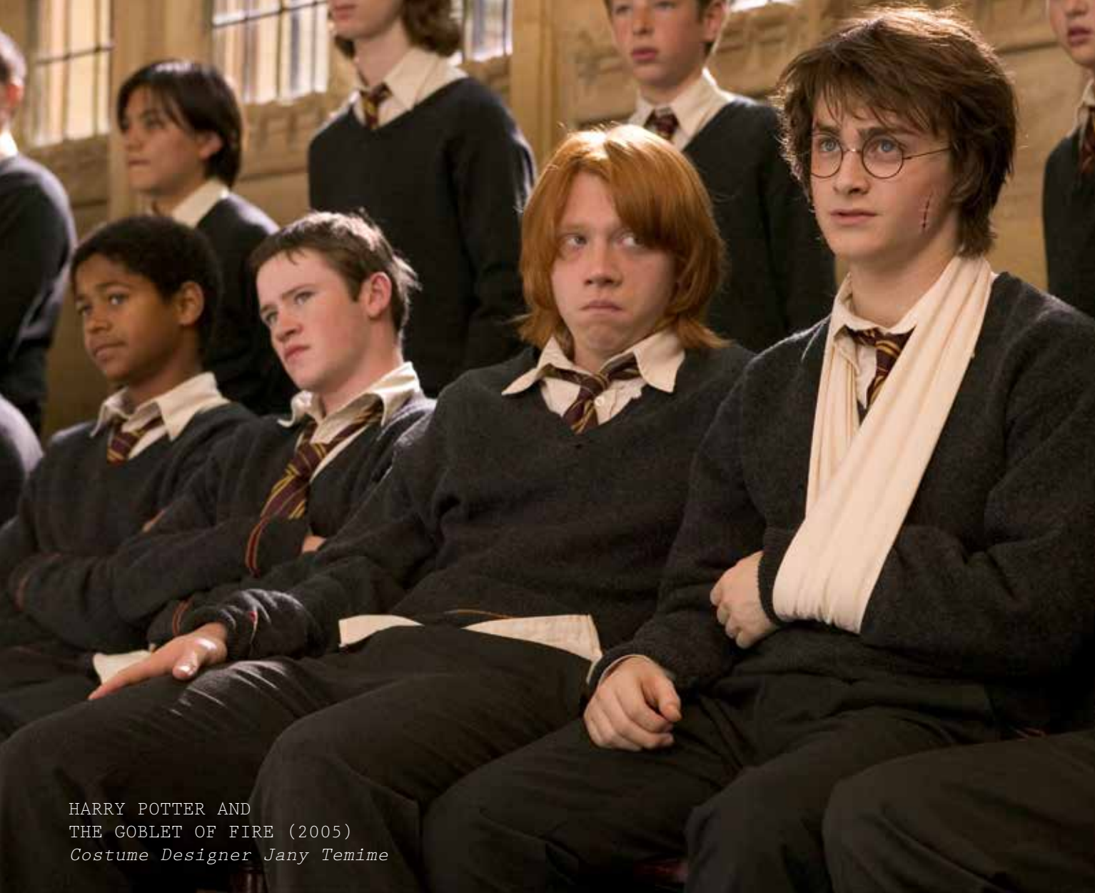
HARRY POTTER AND THE GOBLET OF FIRE (2005) Costume Designer Jany Temime