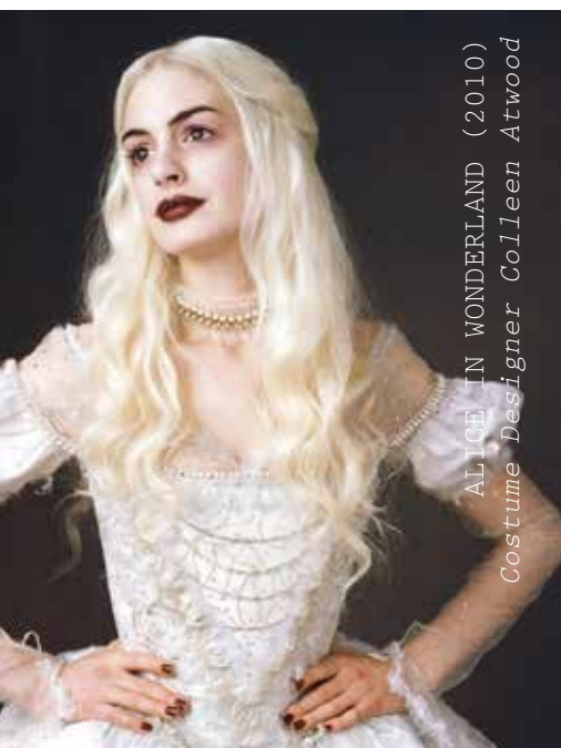
ALICE IN WONDERLAND (2010) Costume Designer Colleen Atwood